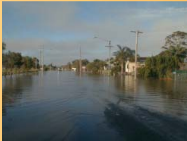
Barnard St flooded, March 2001