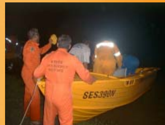
An SES floodboat and crew providing transport for a medical emergency at flood-bound Gladstone, March 2001

This includes realising that evacuation may be necessary in the more severe floods.