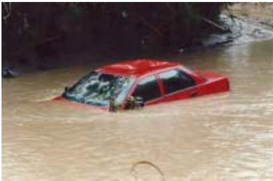
Driving through flood water is dangerous because it is difficult to judge the depth and speed of the water

Keep this guide handy and refer to it when you hear of flooding on the Macleay River